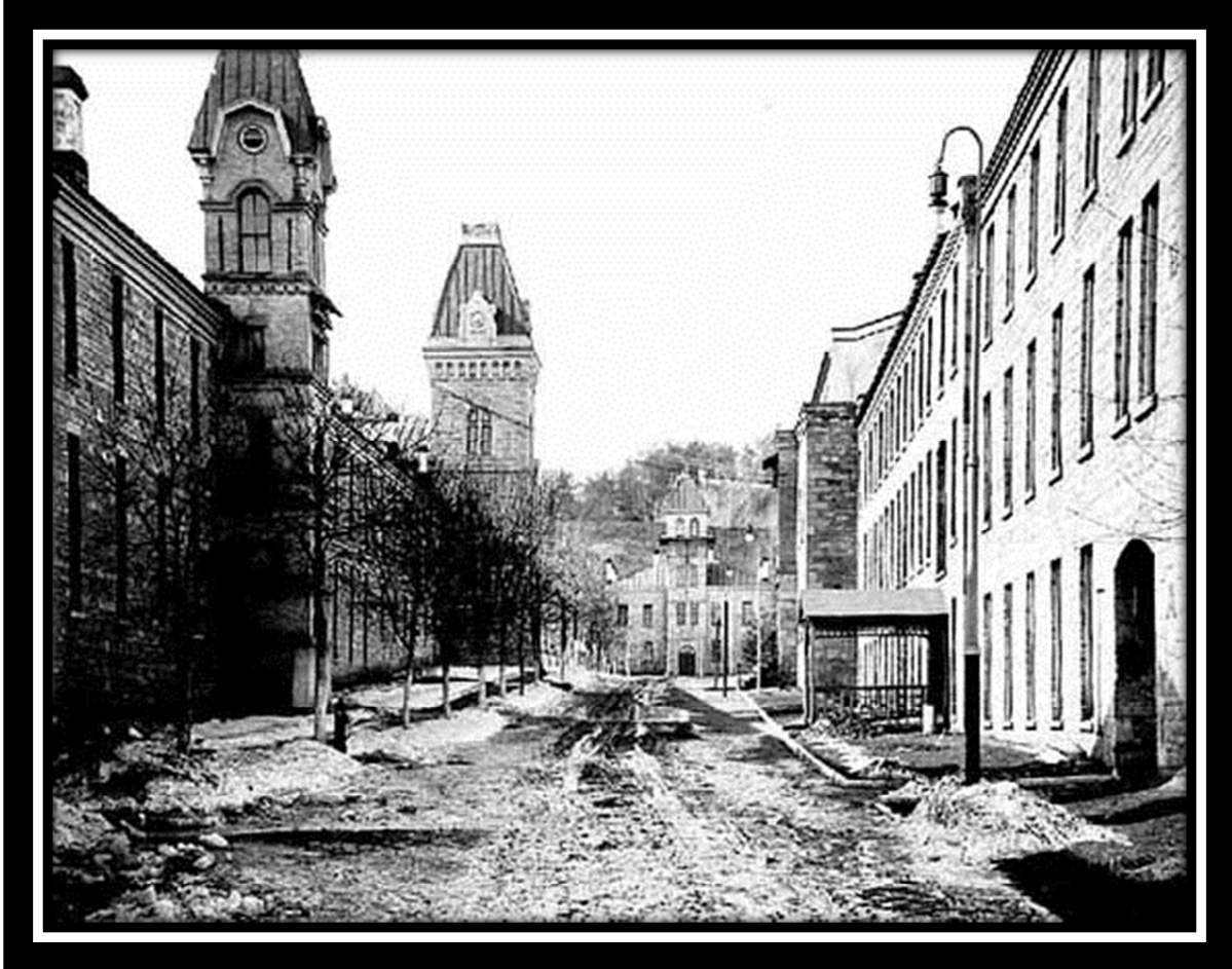
Minnesota State Prison Stillwater, Minnesota Date of photograph: 1902