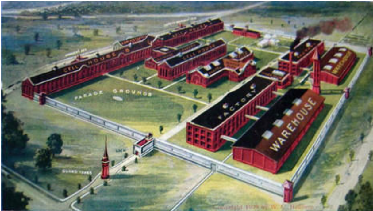
State prison under construction Stillwater, Minnesota Date of postcard: 1909