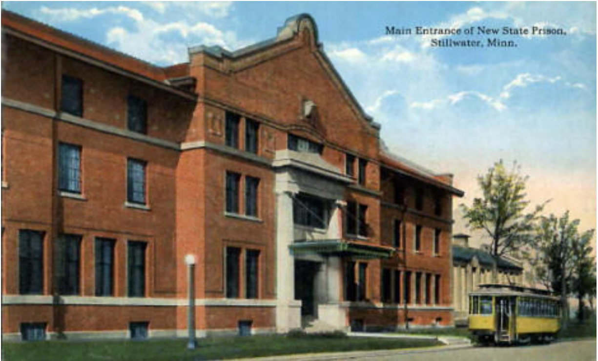
Main Entrance to State Prison Date of postcard: 1910s