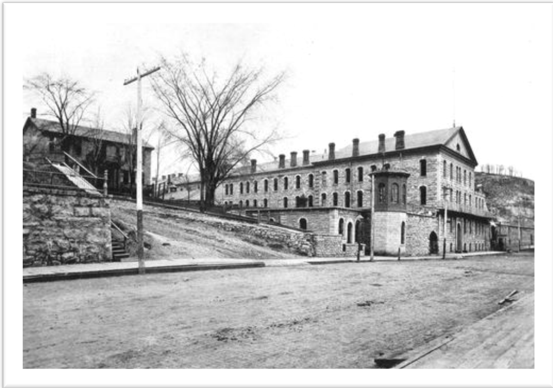
Stillwater Prison and Warden's House Date of photograph: 1885