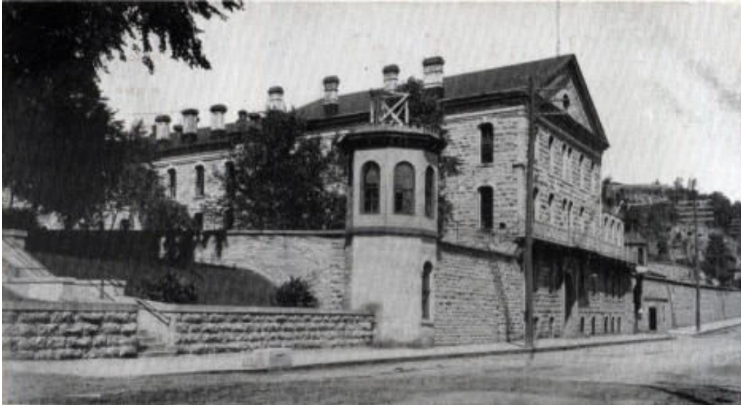
State Prison Date of photograph: 1900s