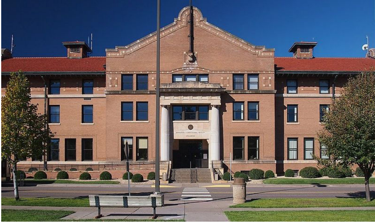
Minnesota State Correctional Facility Formerly known as the State Prison Stillwater, Minnesota It is on the National Register of Historic Places Date of photograph: September 26, 2012