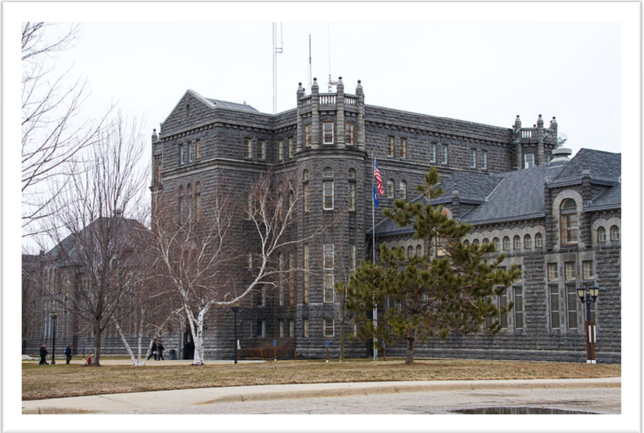
Minnesota State Correctional Facility f/k/a Minnesota State Reformatory for Men St. Cloud, Minnesota It is on the National Register of Historic Places Date of photograph: April 10, 2013