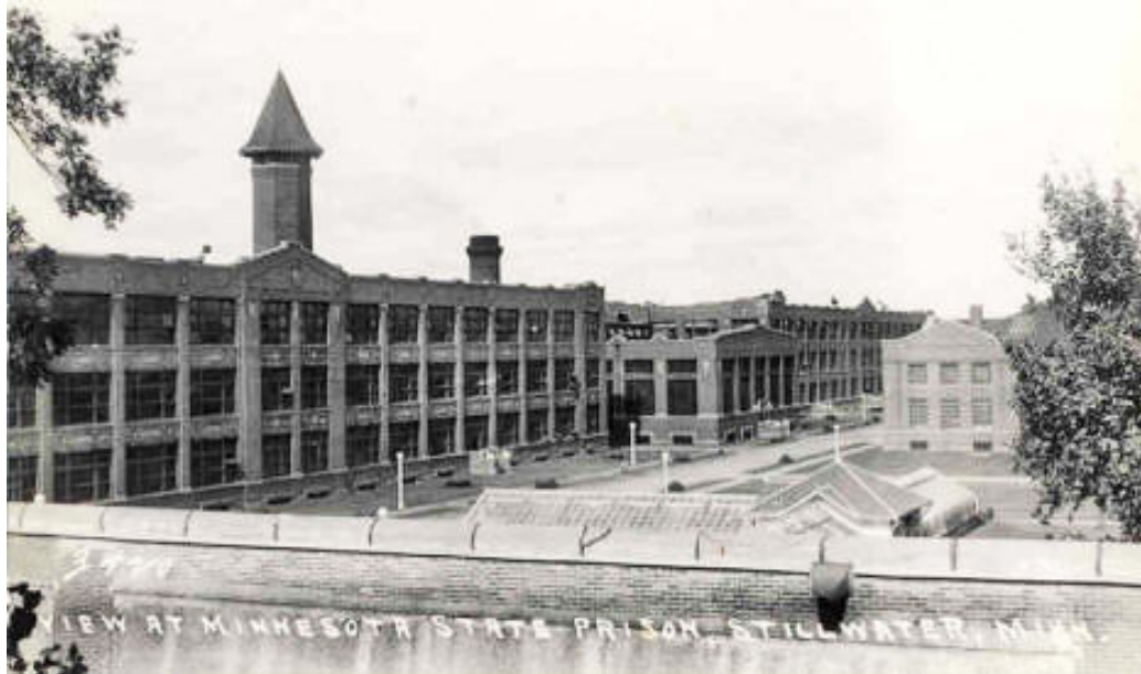
State Prison Date of photograph: 1930s