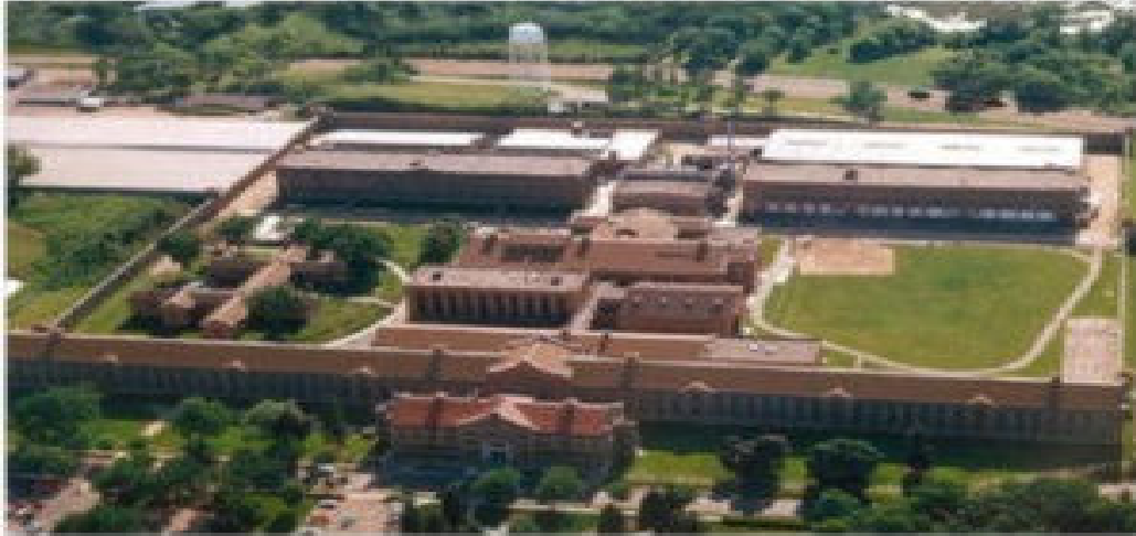
Aerial photograph of Minnesota Prison Stillwater