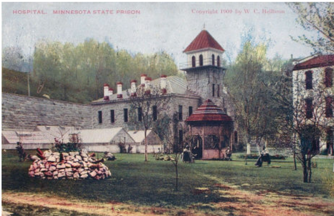
Hospital, State Prison Stillwater, Minnesota Date of photograph: 1909