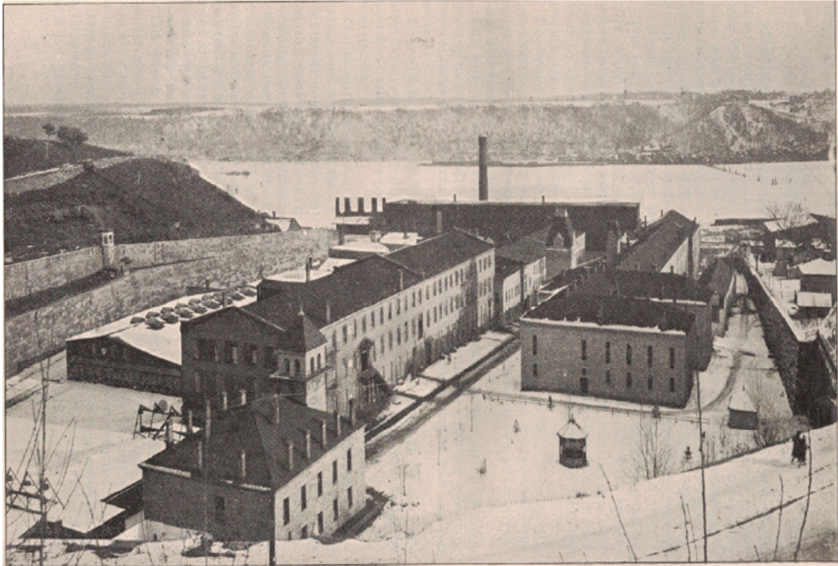
STATE PRISON, STILLWATER.

Date of photograph: ca. 1897.