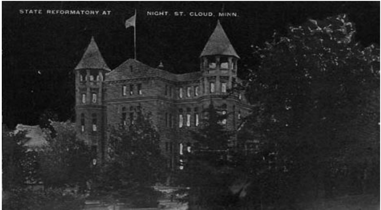
Night at State Reformatory St. Cloud, Minnesota Date of postcard: 1930s