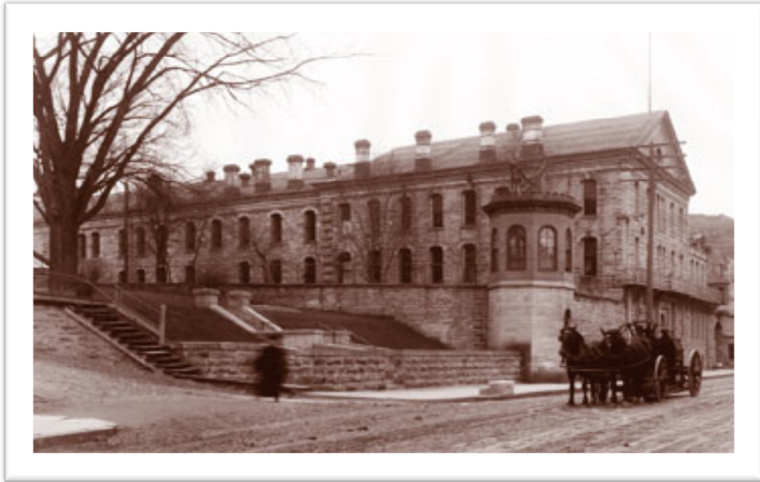
State prison Date of photograph: 1912