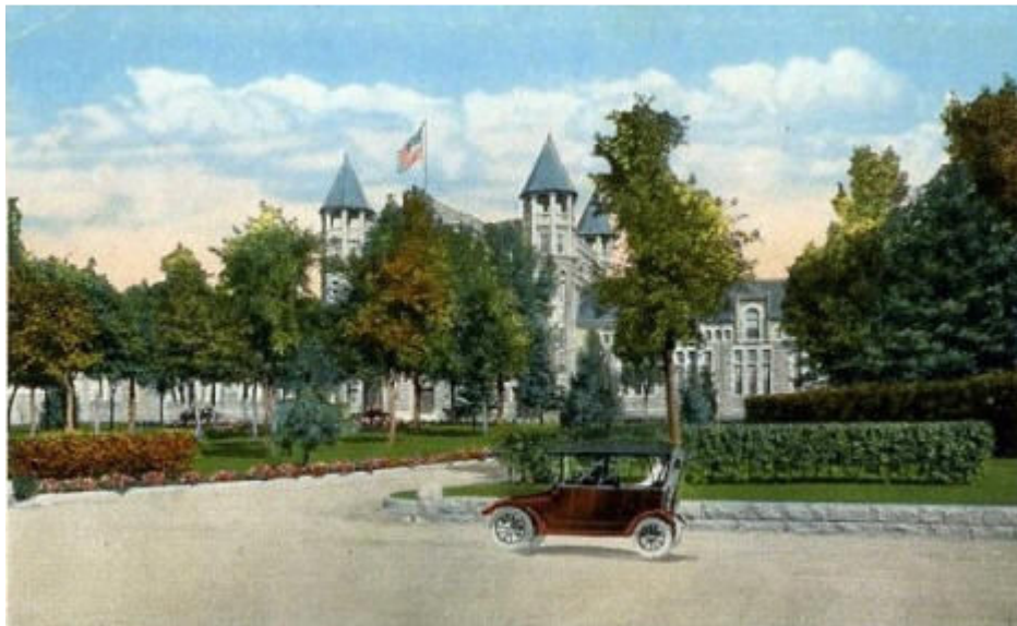
State Reformatory St. Cloud, Minnesota Date of postcard: 1920s