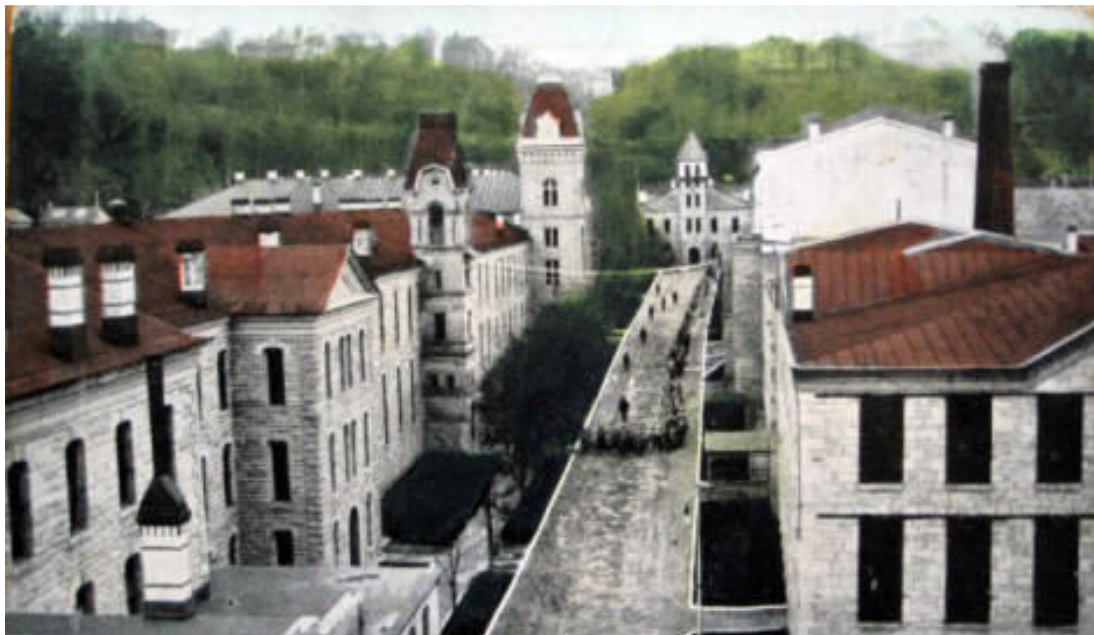
State Prison Date of postcard: 1910s