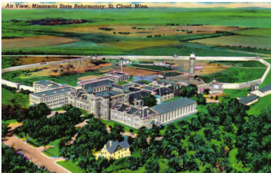
Aerial view of state reformatory St. Cloud, Minnesota Date of postcard: 1930s